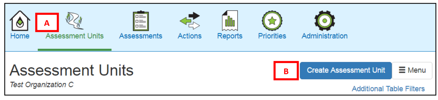
Figure 1—Assessment Units List Page