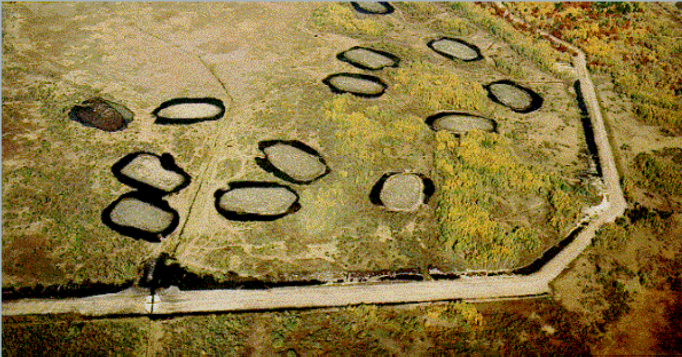
Rice Lake, Minnesota DOT