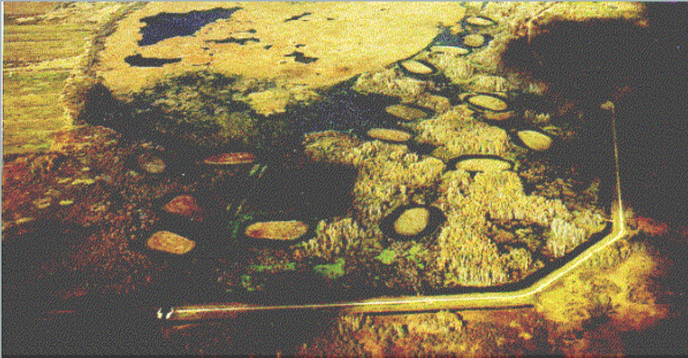
Rice Lake, Minnesota DOT