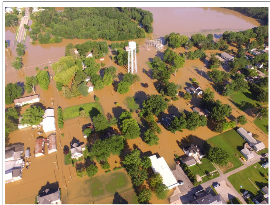
Figure 2 - The result of flood acquisitions in Ottawa throughout the years. Note the number of houses near the water tower in the 2007 photo (top, from August 23, 2007) and the open space around the tower in the 2017 photo (bottom, from July 15, 2017).

The buyouts are distributed across the community, but fall in several clusters (See Figure 3). The first is the former Arrowhead Mobile Home Park, the second is the West End properties. In addition, several smaller lots are distributed across the community, including one property downtown – Paul’s lot – and a string of properties south of town – off of Oak Street (see map).