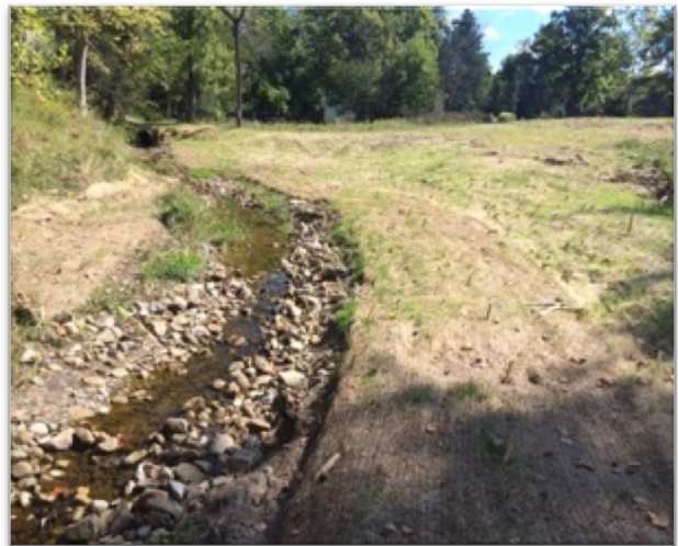
Figure 7- Habitat Restoration