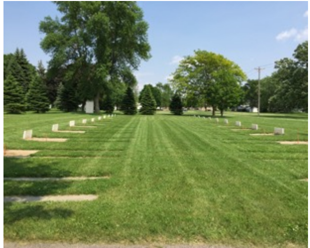
Figure 6 – Recreation Opportunities