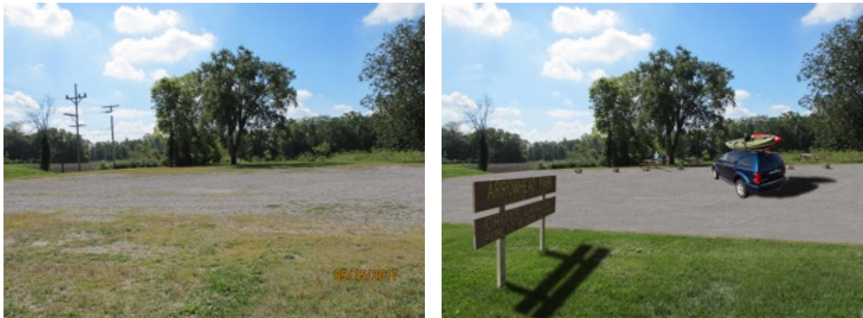
Figure 8 - Before and After images of Arrowhead Park. Better access to the river, a playground, and a picnic area are desired uses. Parking and a restroom are also important. After images produced by Eric Roberts and Orion Thomas from The Ohio State University.

Participants in the workshop had a number of ideas for this site. In fact, given its size, river access, and existing amenities, many participants focused on this site as a good project for the Village to tackle first. Access to the river – for canoeing, kayaking, fishing – was a major focus of the discussion. Other desired amenities for the site included a walking path, playground, shelter/picnic area, bow/archery range, and a sledding hill (See Figure 19). Participants suggested including parking and access to a restroom.