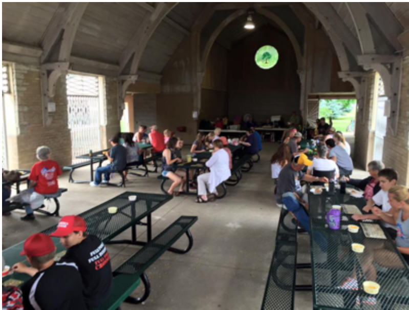
Figure 4: Former church in Austin, MN now used as community center.

Buyouts have been used for parks, gardens, camping, outdoor recreation, wildlife habitat, wetland management and other open space uses. For example, Charlotte, NC has created a greenway and community gardens out of properties it acquired as part of a buyout. East Grand Forks, Minnesota created a campground, while the small town of Montevideo, MN integrated the buyout lands into a prairie restoration project. The most common use of buyout lands, however, is vacant lots.