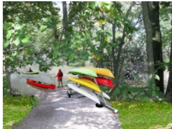
Figure 9 – Before and After images of Oak Street Properties – Participants suggested that river access here would be desirable. After images produced by Eric Roberts and Orion Thomas from The Ohio State University.

Right: Before and After views of river access at Oak Street.