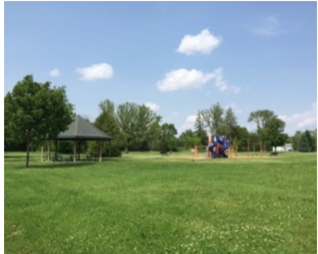
Figure 8 – Community Gathering Spaces