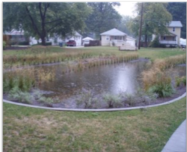
Figure 5 – Gardens and Green Infrastructure