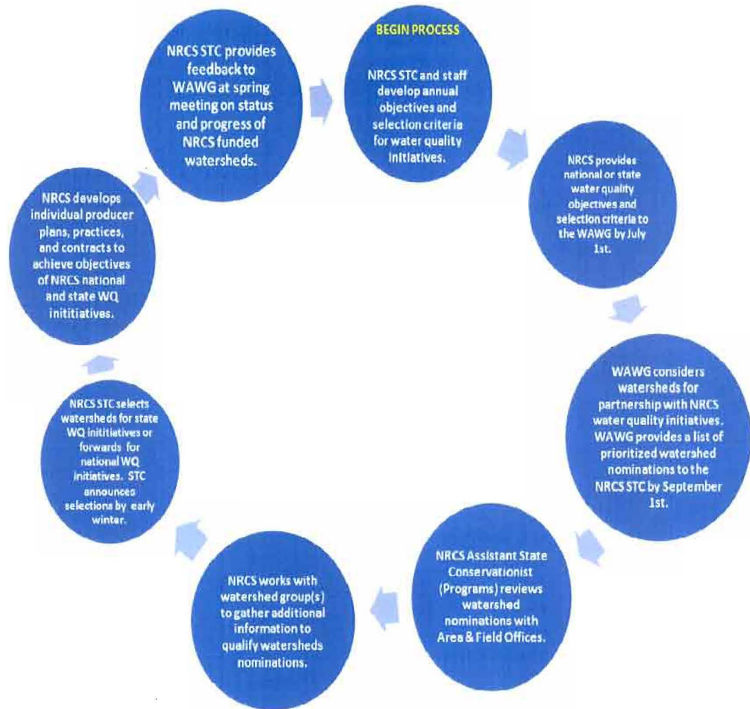
Figure 1. Schematic process to nominate and select watersheds for NRCS water quality funding using the WAWG to facilitate dialogue and engagement.

Note: WAWG – Water Activities Work Group is organized under the Montana Watershed Coordination Council. Membership includes agencies, watershed groups, and interested professionals. NRCS Assistant State Conservationist (Programs) administers financial assistance programs in Montana.