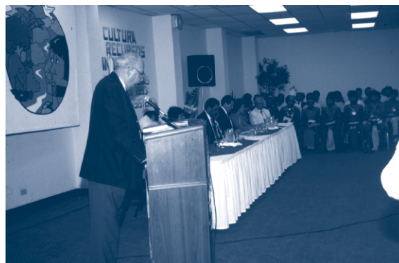
Figure 25. Juan Bautista Chevalier, Panama's Minister of Government and Justice, addresses the Forum, “Indigenous Culture and Resources: Indigenous Lands of the Darién 1993.”

Darién 1993: Subsistence Zones...a Contribution to Sustainable Development,” was held at the Hotel El Panamá on October 26–27, 1993. The corridor outside the hotel conference room had a detailed map exhibit as well as displays of Kuna, Emberá, and Wounaan artifacts. More than 500 people attended during the two-day conference. In addition to leaders from the major indigenous groups of Panama, there were representatives from the Instituto Nacional de