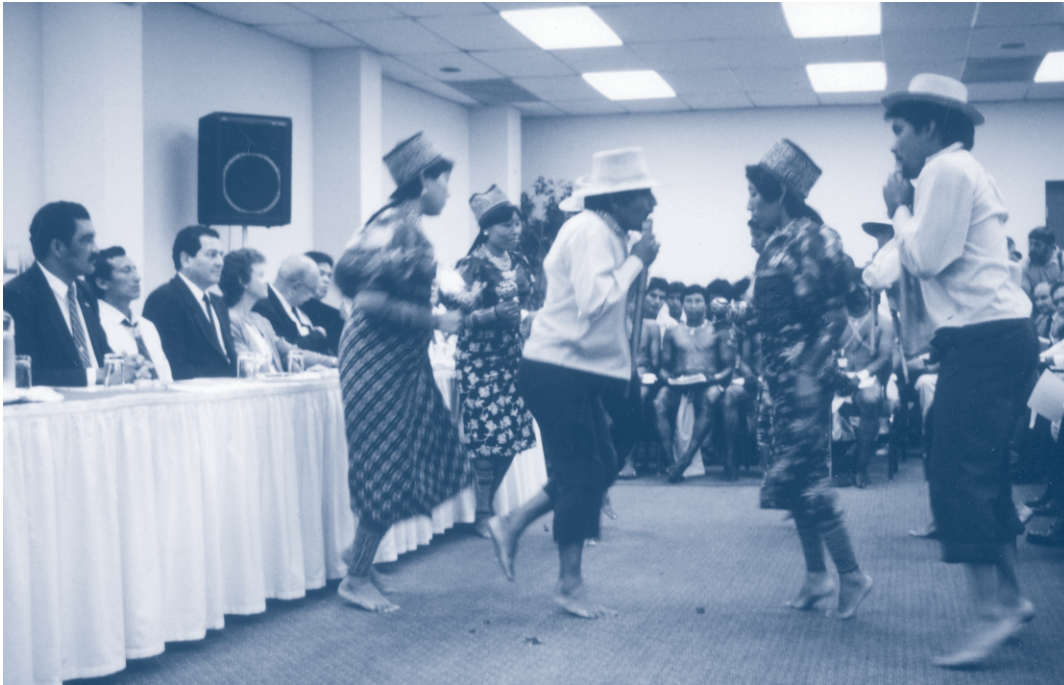
Figure 24. Kuna dancers from the region of Wargandi, Darién Province, entertain those in attendance at the Forum, “Indigenous Culture and Resources: Indigenous Lands of the Darién 1993.”

More than 400 people were present each day.