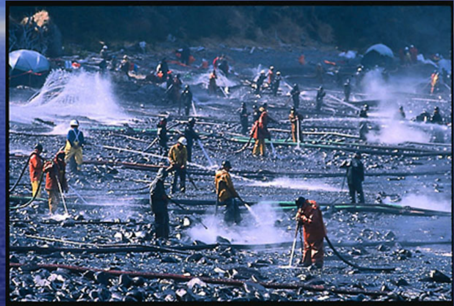
Exxon Valdez Cleanup on Alaska Shoreline