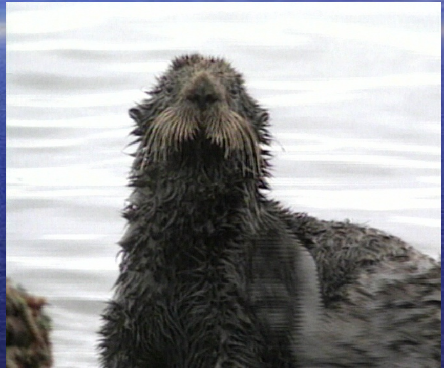
Oil-Soaked Otter in Alaska