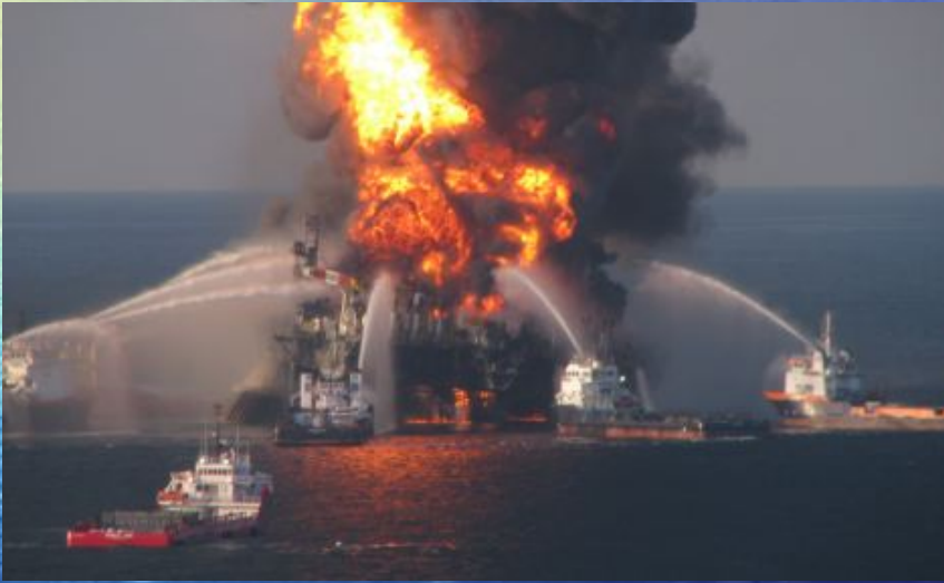
April 2010 British Petroleum Deepwater Horizon Platform Fire, Gulf of Mexico