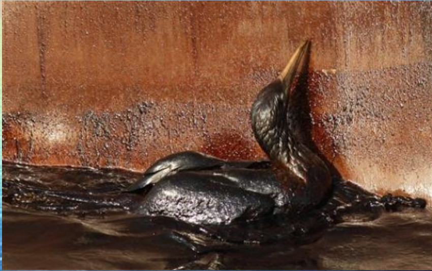
Oil-Soaked Bird Near Deepwater Horizon Platform