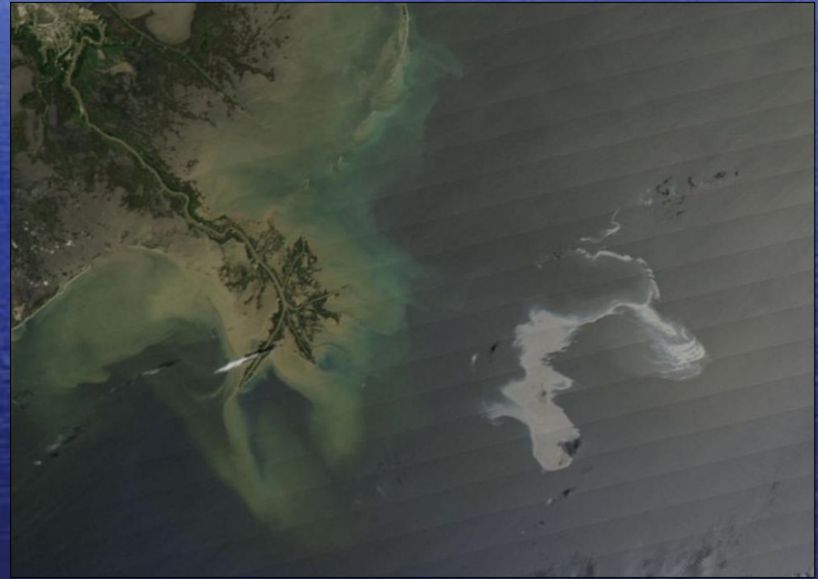
Deepwater Horizon Oil Slick