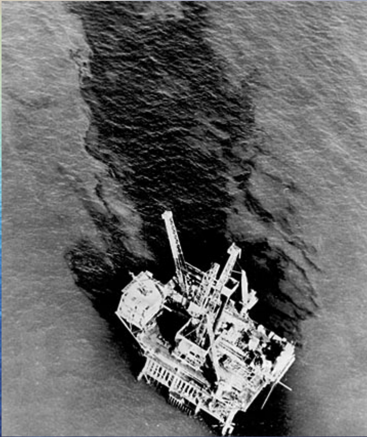
Santa Barbara Oil Spill, 1969