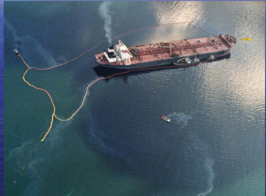
Leaking Exxon Valdez , 1989