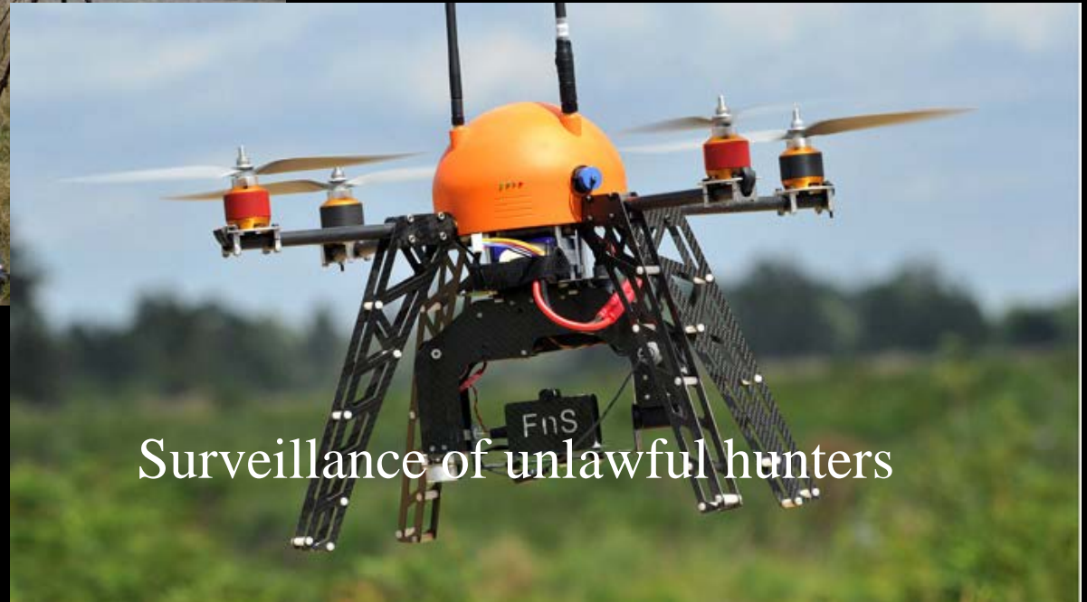
Surveillance of unlawful hunters