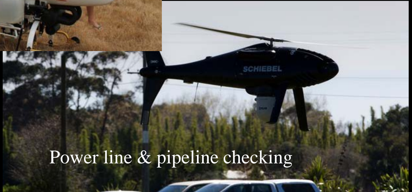
Power line & pipeline checking