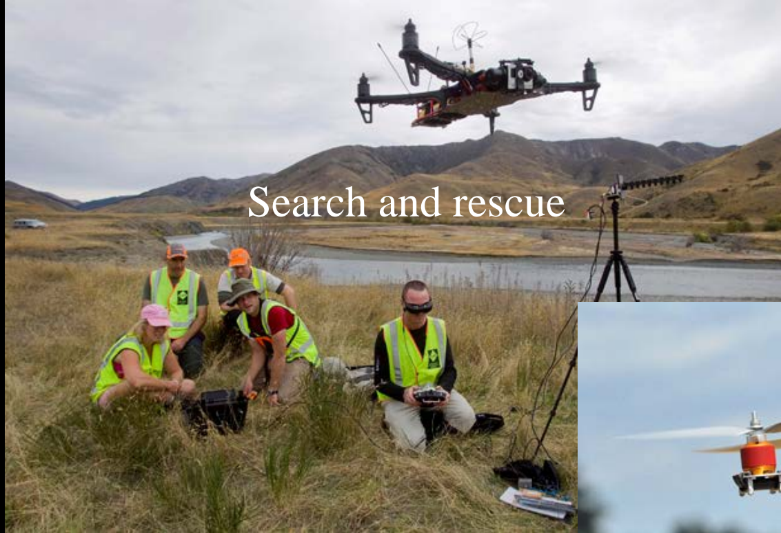
Search and rescue