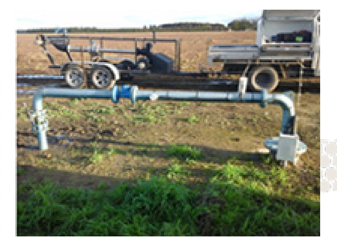
ه ک ک ک ک ک و