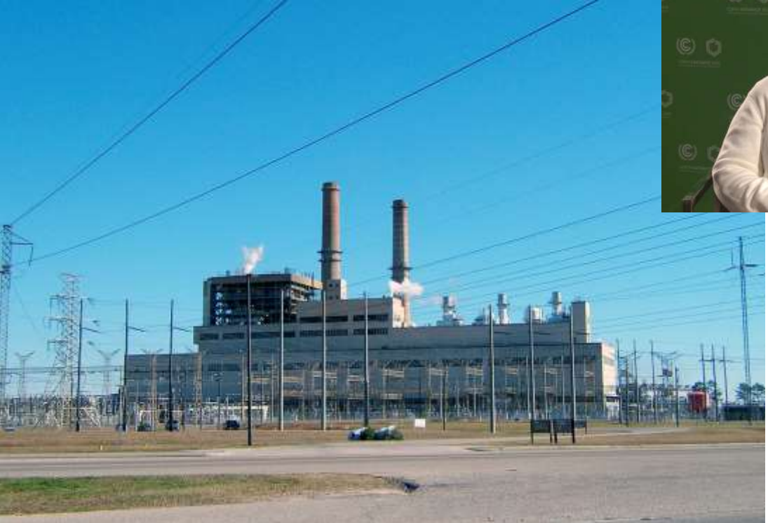
Jack Watson Electric Generating Plant