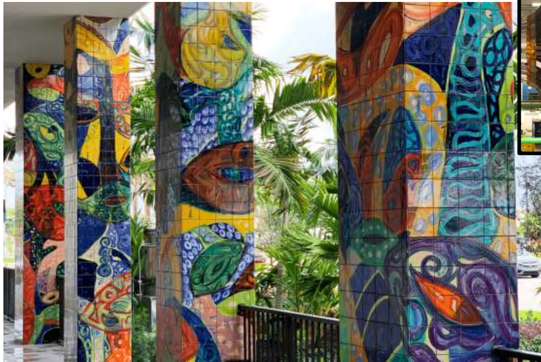
Miami Mangrove Forest