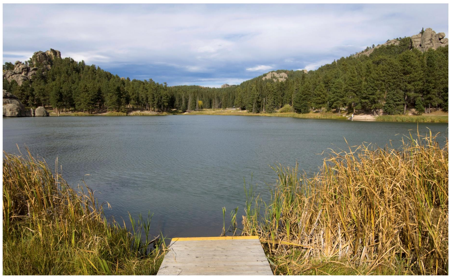
Sylvan Lake, Custer State Park, South Dakota

Awarded to the State of South Dakota and EPA Region 8 for being the first state to successfully navigate the entire submission and approval process in ATTAINS