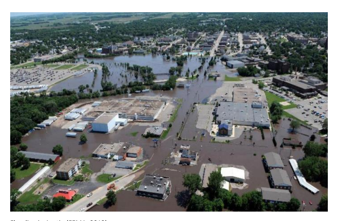
Flooding in Austin (FEMA, 2013)