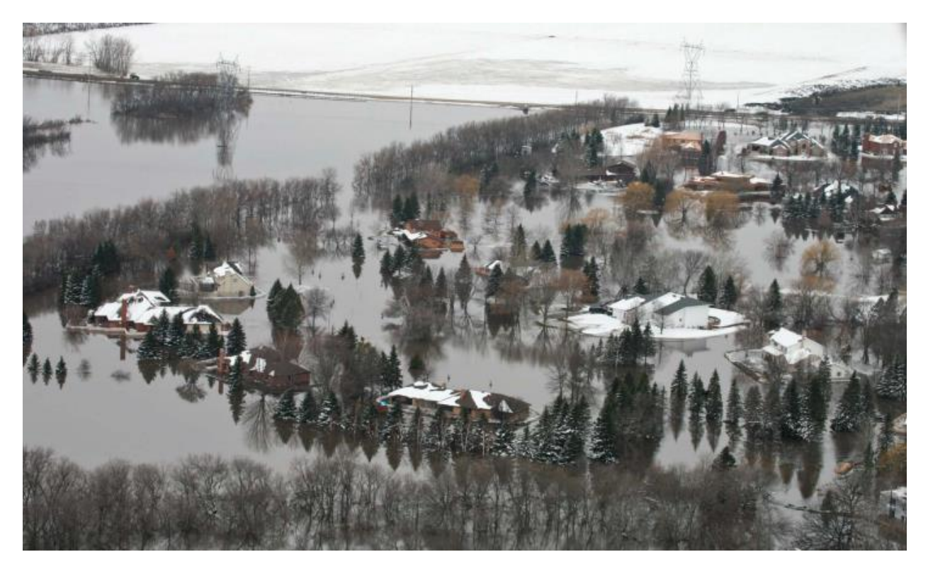
Photo Credit: FEMA, 2010. Evaluating Losses Avoided Through Acquisition: Moorhead, MN