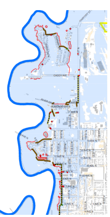
Figure 2: Levees and Sandbags on the Red River