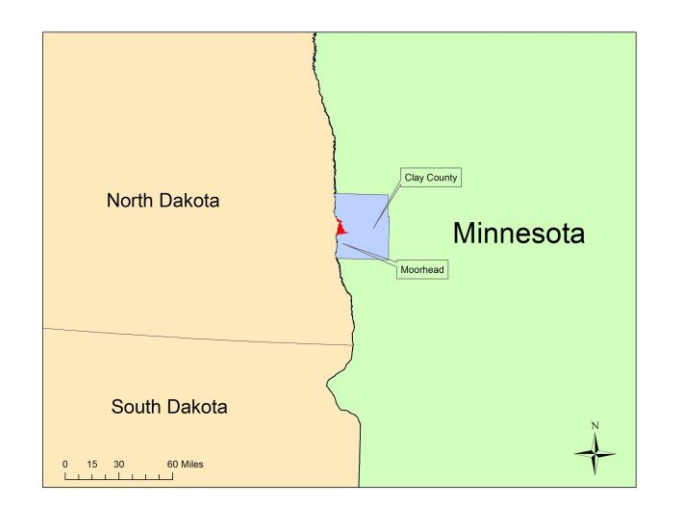
Figure 1: Location of Moorhead, Minnesota

Although agriculture is prominent in the area, Moorhead is also home to notable corporate, manufacturing and distribution industries. The unemployment rate in Moorhead is consistently below the national average and property values are stable in the area.