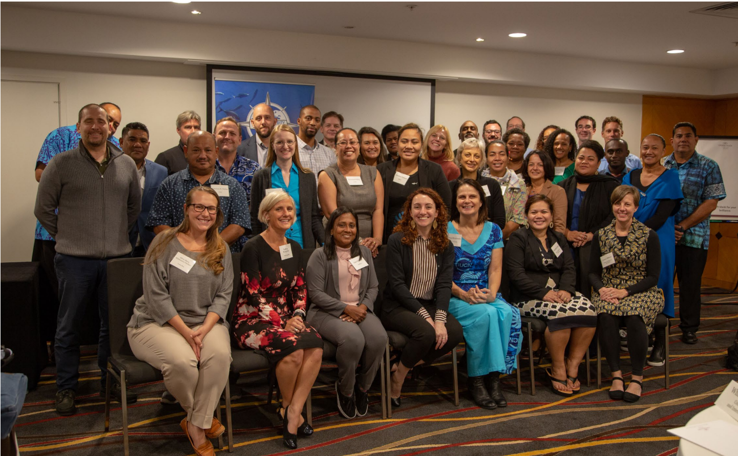
Participants of the 2019 Blue Prosperity Workshop in Auckland, New Zealand