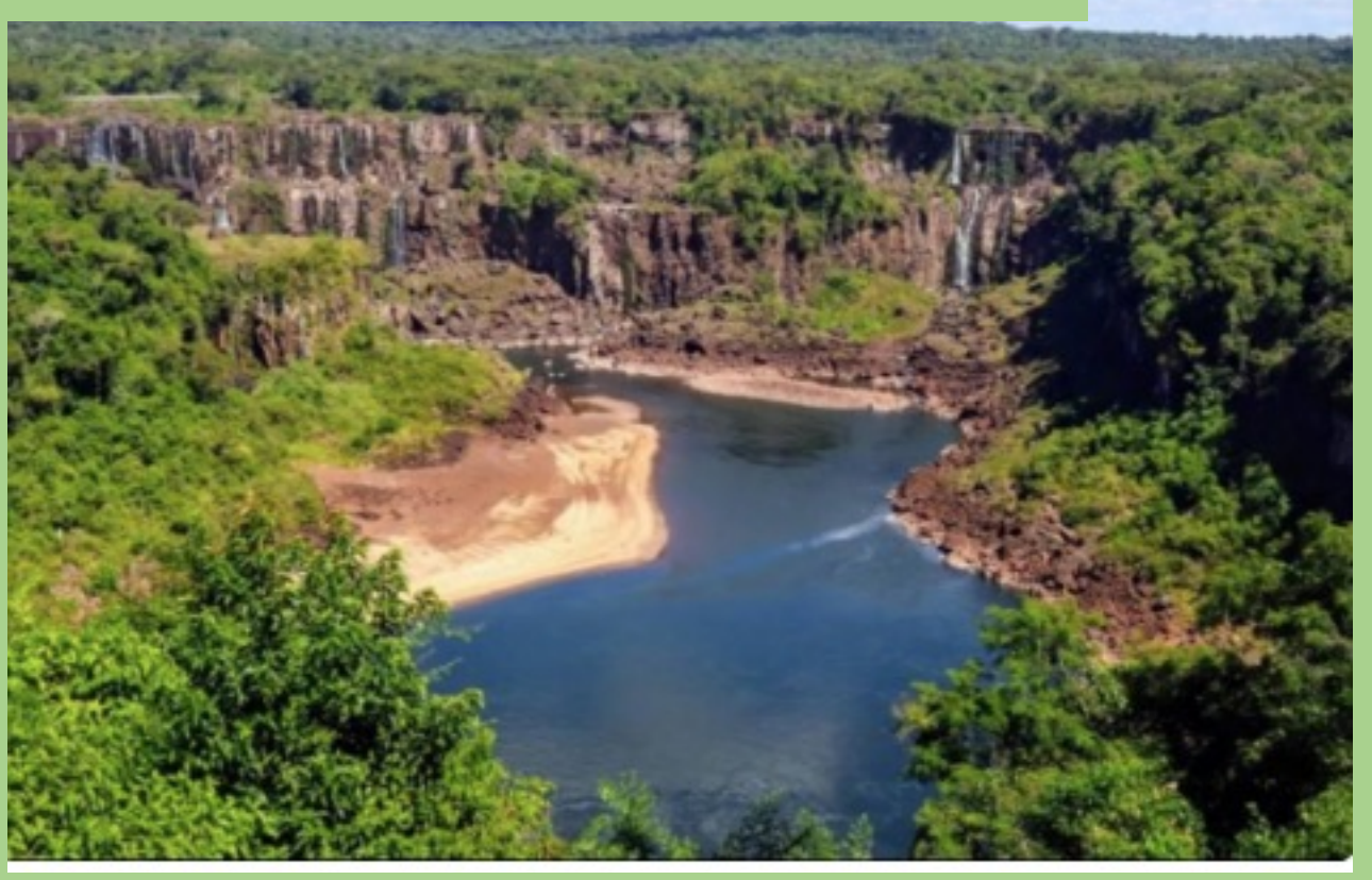
Yguazu Falls are left without Water