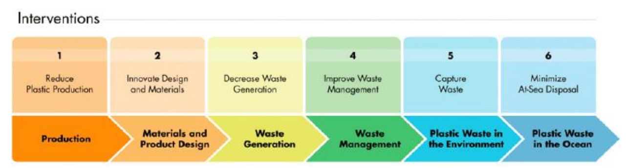
Figure 1. Flow diagram of available plastic waste interventions from plastic production to recapture of plastics in the ocean.<sup>20</sup>

This report analyzes federal authorities with respect to their connection to the various stages of the plastic life cycle. The NASEM Report did not identify a singular, wholesale solution to address global plastic pollution. Instead, based on one of its mandated tasks, the NASEM Report identified a suite of actions (or "interventions") across all stages of the plastic life cycle that could reduce plastic pollution and achieve environmental and social benefits.<sup>19</sup>